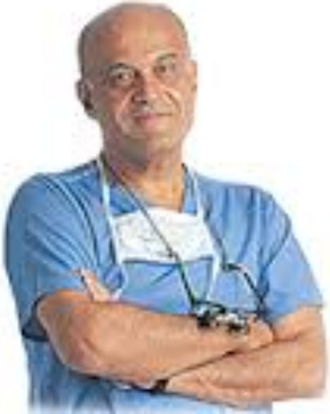
SIR PROFESSOR MAGDI YACOUB